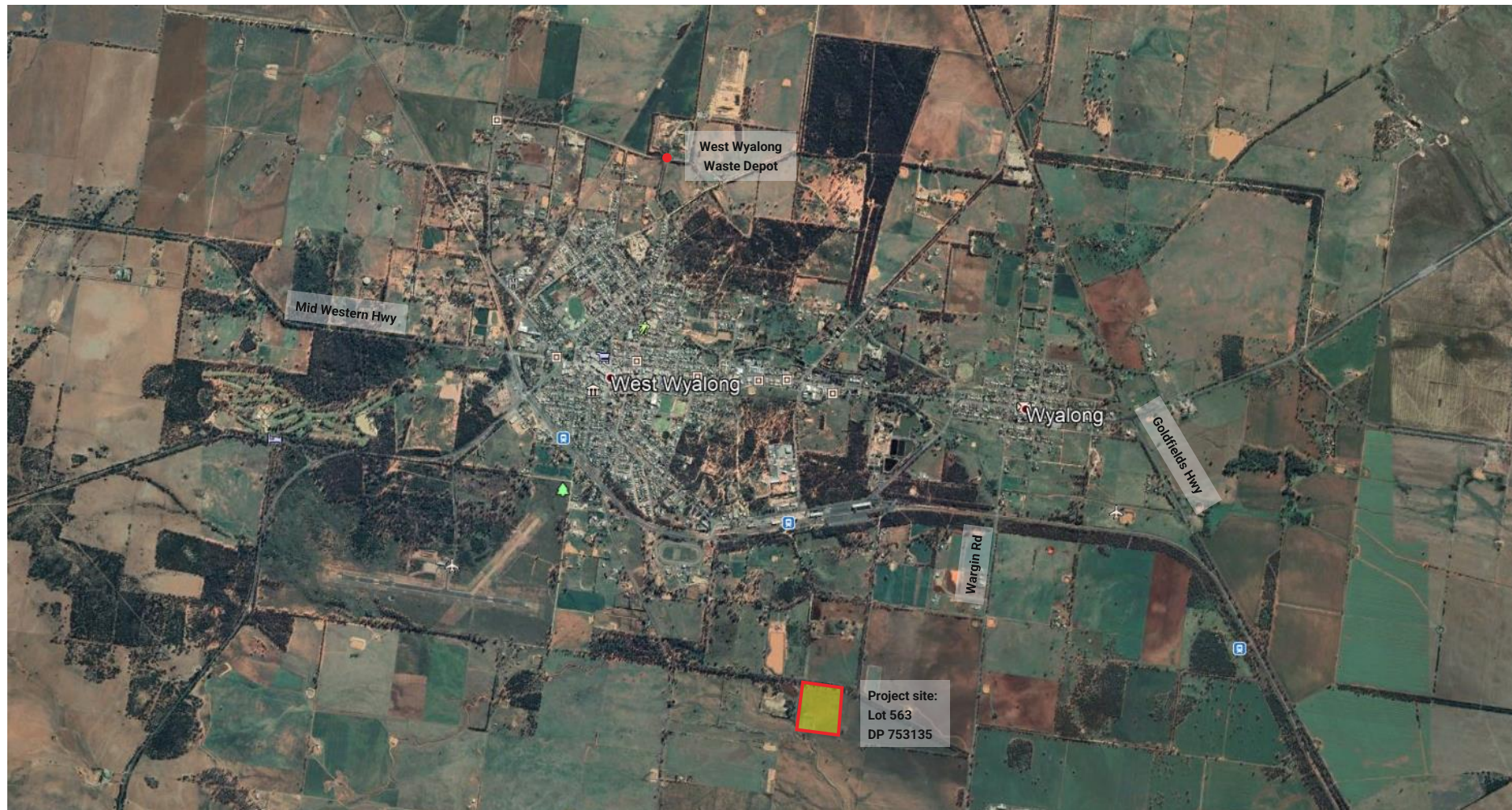
Figure 1 - Proposed 34.92 ha solar farm site and surrounding farm area (note the project will comprise 16.17 ha within this area)